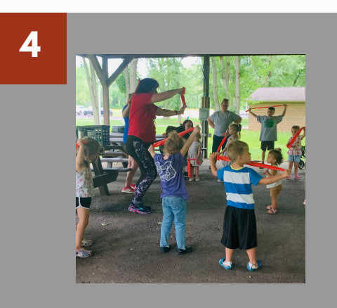
Sensory Storywalk is where I can go to hear stories, sing songs, and play.

This is where our Sensory Storytime program starts